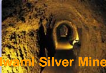
Iwami Silver Mine