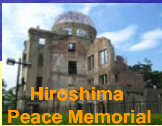
Hiroshima Peace Memorial